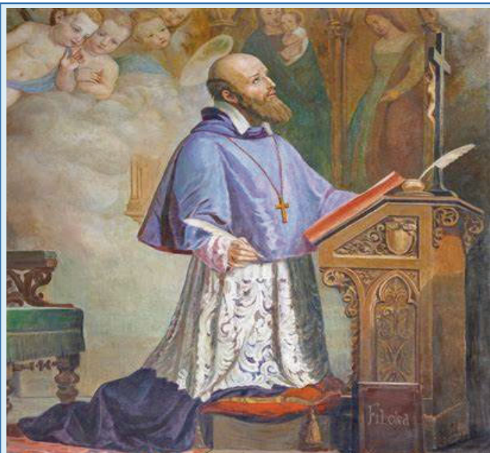
St. Francis de Sales ~ Pray for Us