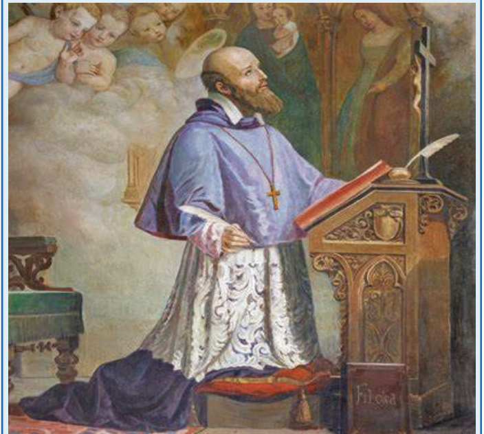
St. Francis de Sales ~ Pray for Us