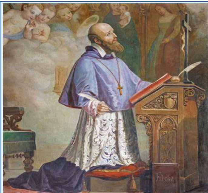
St. Francis de Sales ~ Pray for Us