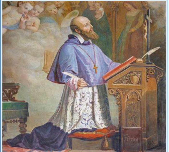
St. Francis de Sales ~ Pray for Us