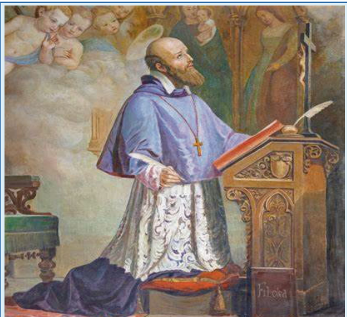
St. Francis de Sales ~ Pray for Us